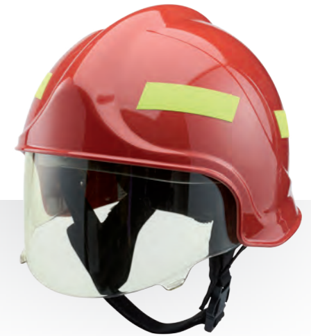
● ● ● COLOR SCALE